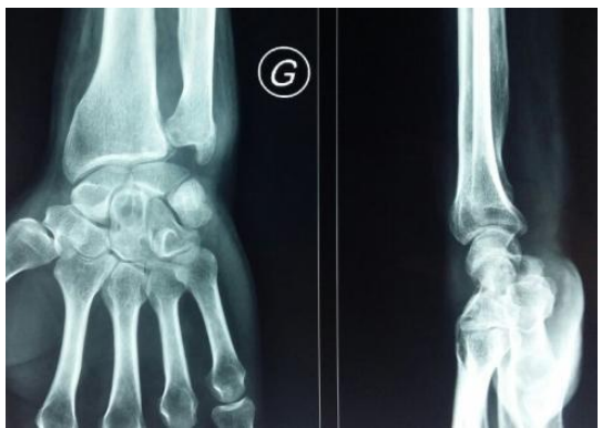
Fig-2: Anteroposterior and lateral radiographic images of the wrist : showed geodes affecting the distal ulna scaphoid and capitatum