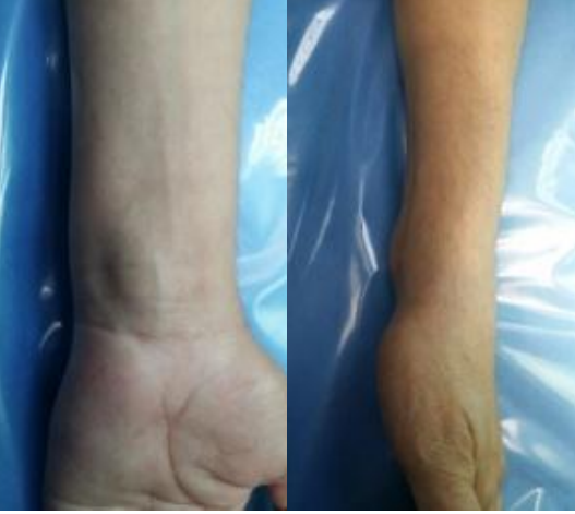
Fig-1: Clinical appearance showing the swelling

isoniazid, rifampin, ethambutol, pyrazinamide At his out-patient follow-up visit at our clinic he has shown good clinical improvement.