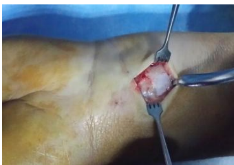
Fig-4: Intraoperative photograph shows the mass