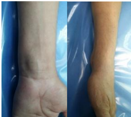
Fig-1: Clinical appearance showing the swelling

isoniazid, rifampin, ethambutol, pyrazinamide At his out-patient follow-up visit at our clinic he has shown good clinical improvement.