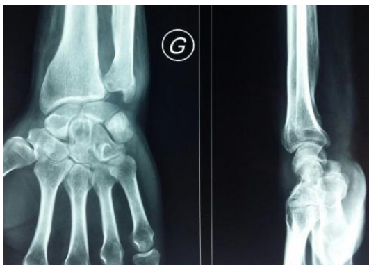
Fig-2: Anteroposterior and lateral radiographic images of the wrist : showed geodes affecting the distal ulna scaphoid and capitatum