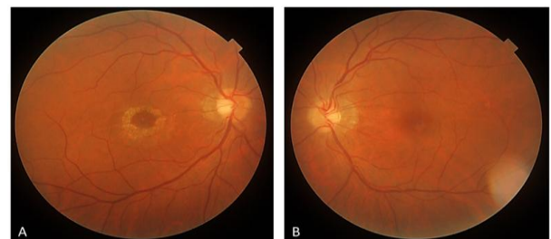
Fig-1: Fundus photographs of the (A) right and (B) left eyes

A 62-year-old Japanese man was referred to our clinic for an ocular fundus abnormality discovered during a medical checkup. He had no subjective complaints. His medical history was unremarkable, and there was no family history of ocular disease. On ophthalmic examination, his best corrected visual acuity (BCVA) was 20/20 in the right eye and 20/20 in the left eye. Both anterior segments as well as ocular pressures were normal. Ophthalmoscopic examinations of the fundi did not reveal any abnormalities in the left eye. In the right eye, a round to oval area of hypopigmentation was seen in the macula (Figure-1), and normal fundus coloration was maintained in the fovea of the right eye.