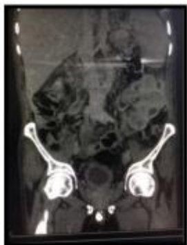
Fig-1: Non-contrast CT scan showing a big stone in the bulbar urethra and thick walled bladder

Non-contrast CT showed no intraperitoneal fluid collection, right moderate hydronephrosis, dilated left ureter with 2 stones in its lower end and 3 stones in the proximal bulbar urethra (fig 1). Retrograde urethrocytogram showed a 3 cm stricture segment at the distal bulbar urethra and another annular stricture at the proximal bulbar urethra in addition to an urethral diverticulum in between containing the stones and grade 4 right vesico-ureteral reflux (fig. 2).