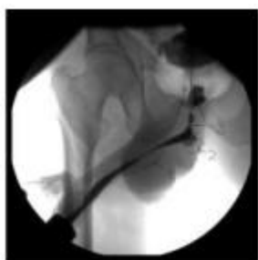
Fig-2: Antigrade urethrogram showing (1) distal bulbar urethral stricture 2.5 cm., (2) urethral diverticulum, (3) proximal bulbar annular stricture

Patient was then booked for endoscopy and possible exploration. Visual internal urethrotomy was done for the proximal and distal bulbar strictures, the neck of the urethral diverticulum was seen with the