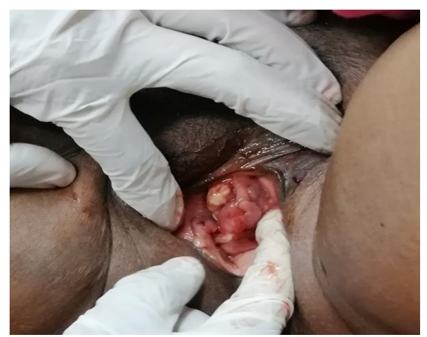
Fig-1: Clinical presentation

Incidentally her 35-year-old daughter, was diagnosed with a complex ovarian mass while her mother was undergoing treatment at our institute. Her CA125 was 1931 IU/ml. She underwent laparotomy followed by total abdominal hysterectomy and bilateral salpingo-oophorectomy and Infra-colic Omentectomy. Intraoperatively, the mass was diagnosed as a 10cm x 10cm endometrioma. Histopathology revealed Ovarian Endometriotic cyst with focal areas of dysplasia (Immunohistochemistry - benign). She is under followup at present.