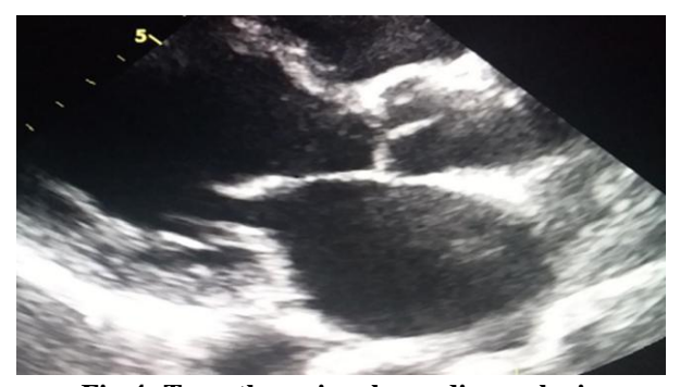
Fig-4: Transthoracic echocardiography in parasternal section long axis