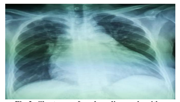
Fig-3: Chest x-ray found cardiomegaly with a rectilinear left middle arch