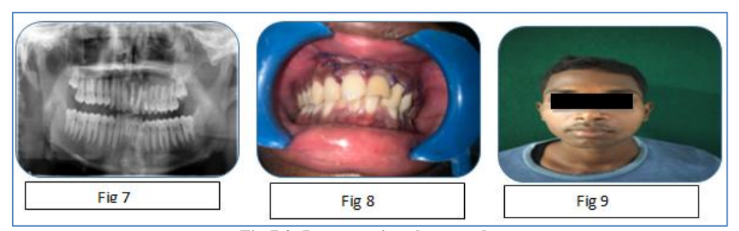
Fig-7-9: Postoperative photographs