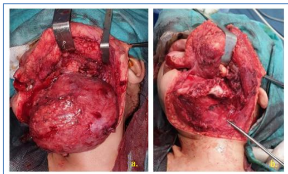
Fig-3: Operative basale view highlighting the tumor before resection (a). View after resection (B)