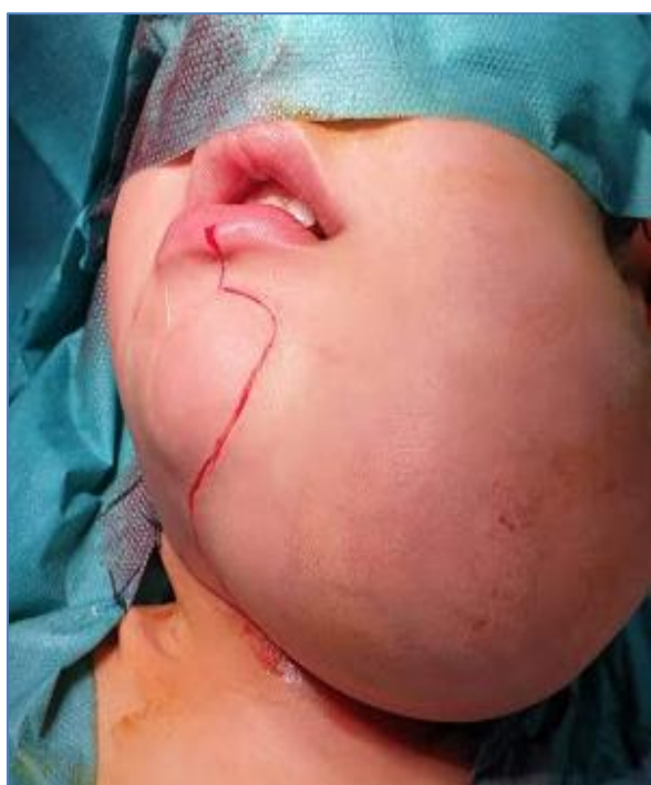
Fig-2: Operative basale view of the tracing of the transfacial ET high cervicotomy incision.

On the basis of radiological et histopathological findings, wide surgical excision of the mass was performed. We opted for a transfacial approach continuing with a high cervicotomy incision for better exposure of the structures (Fig.2). Surgical exploration objectified an encapsulated and individualizable and cleavable oval tissue mass, pushing back neighboring tructures (Fig. 3, 4).