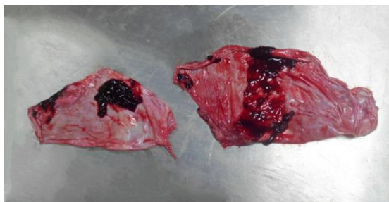
Fig-3: Sinus dura mater containing fresh and coiled to cylindrical antemortem thrombi