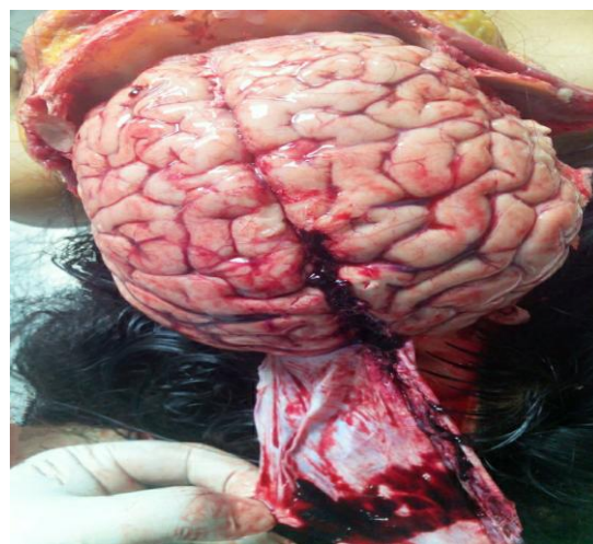
Fig-1: Dark purplish thrombi in the Superior Sagittal Sinus

No evidence of pulmonary embolism or DVT of either lower limbs or pelvic veins was found. No chronic cardiac or pulmonary pathology was present. Toxicology analysis of viscera and body fluids was negative for any poison or abnormal drugs.