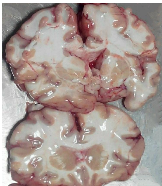
Fig-4: Cerebral ischemic infarcts involving bilateral basal ganglia, thalami and the watershed zones