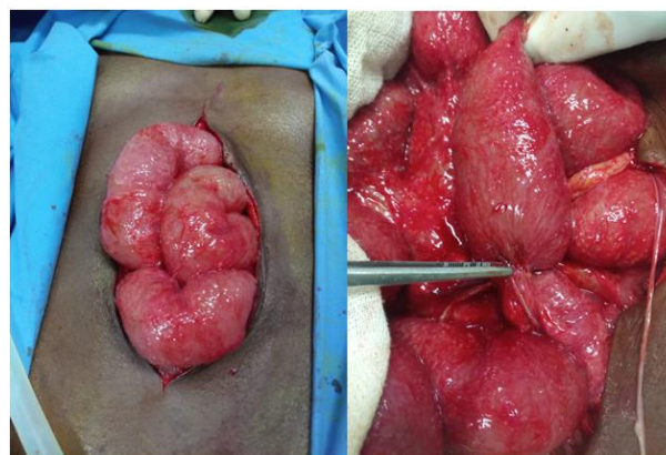
Fig-2: Peroperative findings