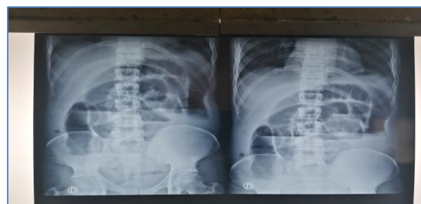
Fig-1: Plain Abdominal X-ray film

Histopathology analysis carried out on the biopsy specimens revealed on the lymphadenopathy, an altered eosinophilic necrosis, surrounded by numerous epithelioid cells without clear granulomas and on the omentum, epithelioid granulomas without necrosis. There was no gigantic cells. These results were in favor of a mycobacterial disease (Image 3). The patient was declared cured of tuberculosis five months later.