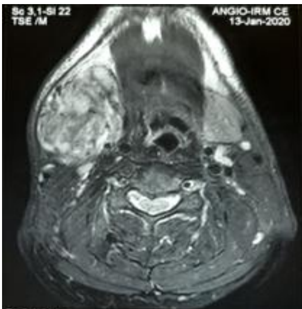
Fig-2. Angio-MRI: Aspect of a formation in the right submaxillary gland, well hyper diffusion, strongly enhanced, suggesting first of all a cylindroma