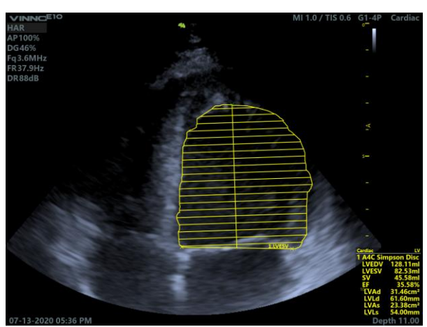
Fig-2: Ejection Fraction