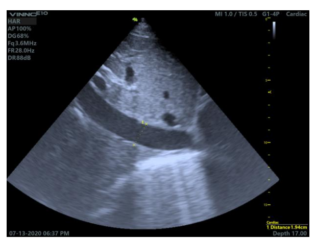
Fig-4: Vena cava diameter