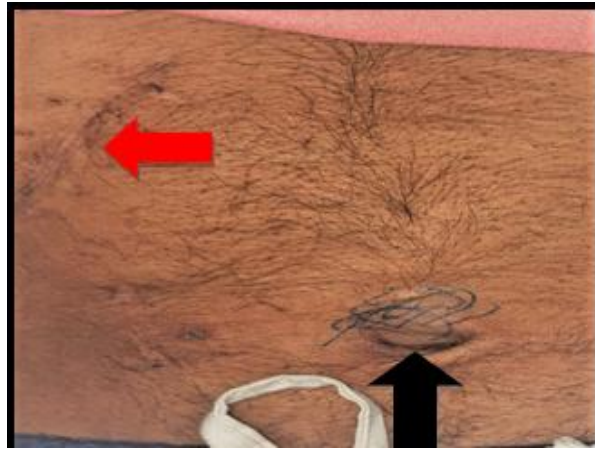
Fig 1: Sister Mary Joseph's nodule measuring 2x1 cm (black arrow) along with Incision scars of Cholecystectomy (red arrow)

Patient gave history of appearance of umbilical nodule one month after the surgery. FNAC was done from the nodule, which showed tumor cells arranged in vague acinar pattern, clusters and were scattered in singles. The cells showed marked anisonucleosis with