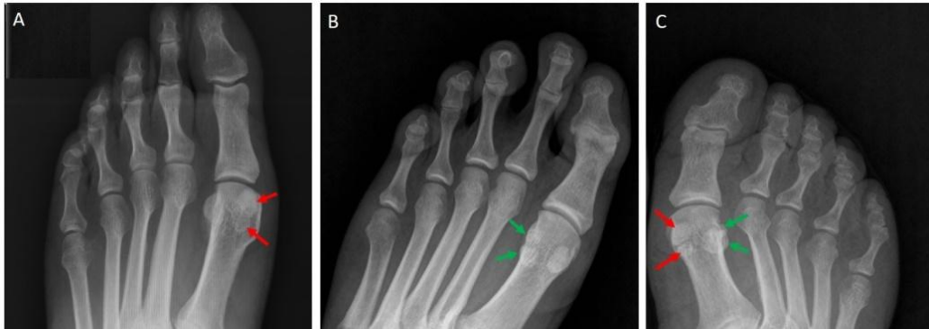
Fig-1: AP radiographs showing A: bipartite medial hallucal sesamoid (red arrows) in a 29-year-old female, B: bipartite lateral hallucal sesamoid (red arrows) in a 49-year-old male, and C: bipartite medial and lateral hallucal sesamoids (red and green arrows) in a 61-year-old female