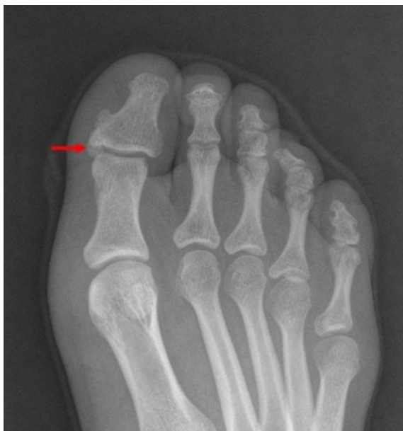
Fig-3: AP radiographs showing hallucal sesamoid bone in a 32-year-old female (red arrow)