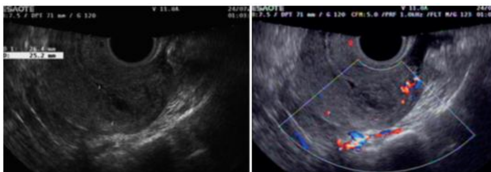
Fig-4: Transvaginal ultrasound images in a Type I PSTT: (a) demonstrating a heterogeneous echogenic mass located in the uterine cavity and (b) showing minimal blood flow at the border of the lesion on color Doppler imaging

The most common site of metastasis is the lungs, therefore imaging of the lungs is usually recommended. Chest CT is more sensitive in detection of lung metastases with greater accuracy. For staging assessment, total body CT and contrast dye may be substituted by 18-fluorodeoxyglucose positron emission tomography CT-scan. MRI imaging of the brain and CT of the abdomen are recommended to those with lung metastases, which may alter staging and subsequent management.