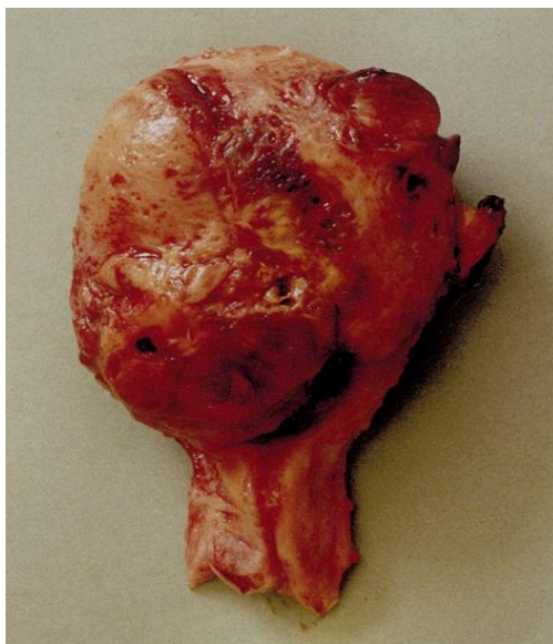
Fig-1: Hysterectomy specimen showing Placental site trophoblastic tumor, an ill-defined mass which has replaced and permeated myometrium

On histopathological examination, the tumors are characterized by gross nuclear and cytoplasmic pleomorphism of intermediate trophoblast cells. The proliferation of the intermediate trophoblastic cells evolves like nodule, which then infiltrates and proliferates between the smooth muscle cells separating them as cords and sheets (Figure 2) (Picture courtesy of Rebecca N Baergen MD). There is angioinvasion of the decidual spiral arterioles, associated with necrosis and