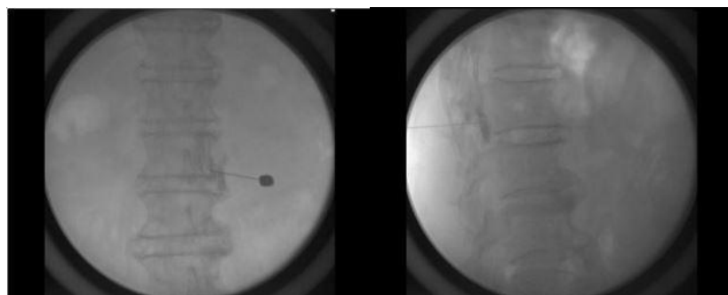
Fig-3A L1 transforaminal epidural block, Fig-3B L1 transforaminal epidural block, Anteroposterior view Lateral view.