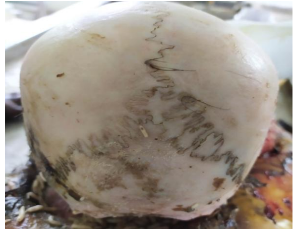
Fig-4: Wormian bones in sagittal and lambdoid suture