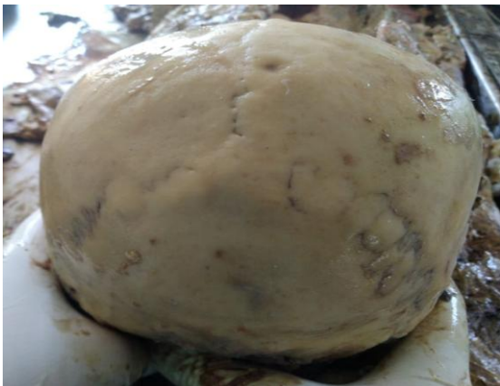
Fig-2: Wormian bones in bilateral lambdoid sutures