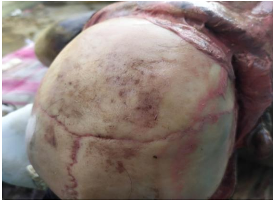
Fig-1: Wormian bone in right coronal suture