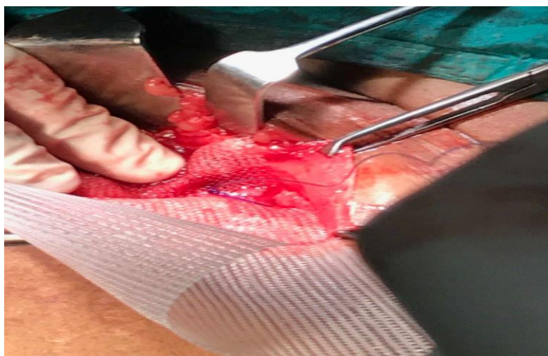
Fig-3: Intraoperative mesh fixation