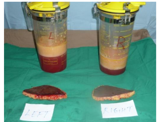
Fig-5: Aspirate and skin excision specimens