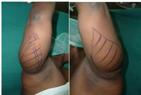
Fig-2: Picture showing the areas marked for liposuction