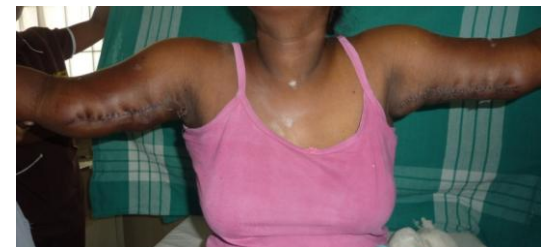
Fig-6: Early post-operative picture