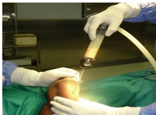
Fig-3: Liposuction being done