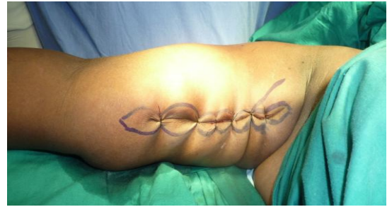
Fig-4: Mock reduction brachioplasty done

brachioplasty was re-confirmed. Mock reduction was done by reducing the area with interrupted sutures and amount of skin flap to be excised was confirmed in the medial aspect. (Fig. 4) The marked area was excised sequentially and a total of 700gm of skin and subcutaneous adipose tissue on each side was removed. (Fig. 5) Haemostasis was secured and the incision was closed in layers with 2-0 polyglactin and 3-0 nylon sutures over a suction drain. Compression dressings applied. Post-operative was uneventful and sutures were removed on the 14 th post-operative day. (Fig. 6) Compression garments was advised for a period of three months. Another two more cases, a 38 year old female with a BMI of 26kg/m 2 and a 32 year old female with a BMI of 27kg/m 2 came with similar complaints and bilateral lipobrachioplasty was done for both the patients with good results (Fig. 7, 8). One patient had seroma formation which was evacuated and managed conservatively.