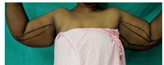
Fig-7: Patient 2 with bilateral lipodystrophy