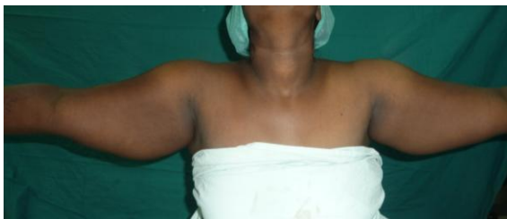
Fig-1: Pre-operative photograph of patient 1 showing bilateral lipodystrophy of the arms