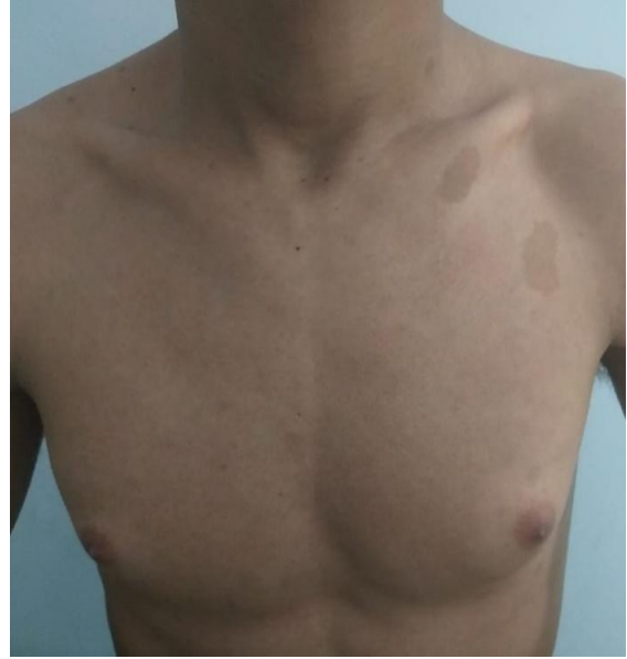
Fig 2: Café au lait spots