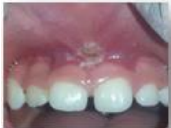
Fig-8.a: healing after 10 days