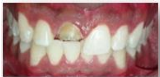
Fig-10: Gingival hyperpigmentation due to melanin