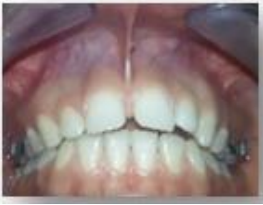
Fig-4: Traction of the upper lip to highlight the labial frenulum insertions