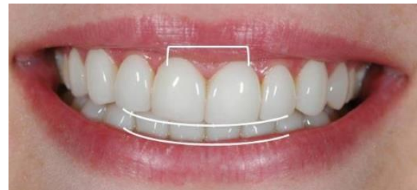
Fig-2: Harmonious and aesthetic smile (harmonious relationship between teeth / gum / lips)[3]