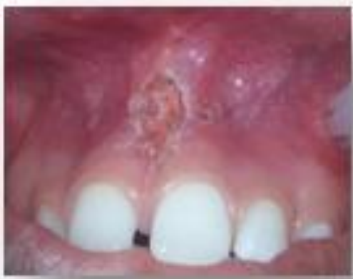
Fig-7: Immediate postoperative situation: note the excellent hemostasis