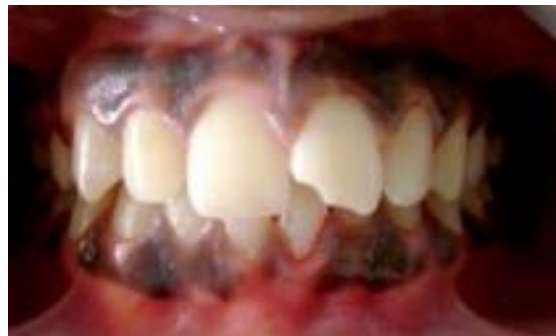
Fig-9: Gingival hyperpigmentation characterized by a general blackish coloration of the gum