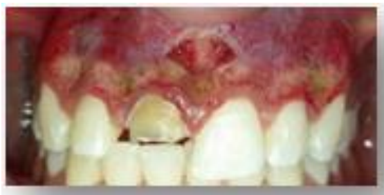
Fig-11: Depigmentation and freepigmentation with diode laser / immediate postoperative situation