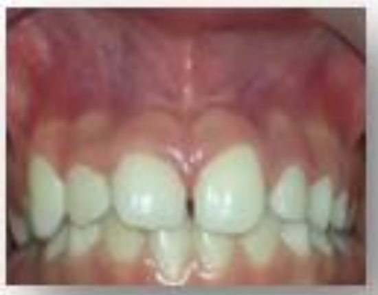
Fig-8.b: healing at 1 month