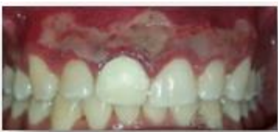
Fig-12.a: healing at one week