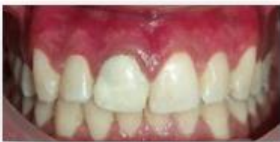
Fig-12.b: result at one month: aesthetic satisfaction