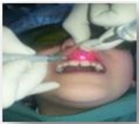
Fig-5: laser fiber in action