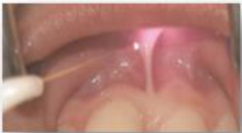
Fig-6: Incision along the axis of the brake