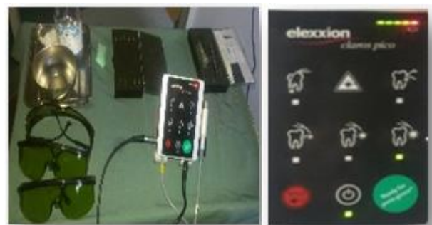
Fig-3: Preparation of the surgical table for the diode laser