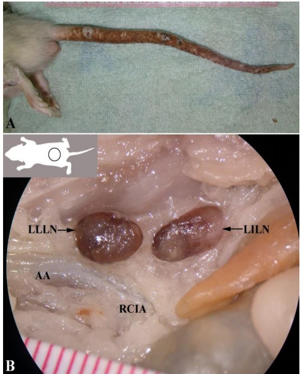
Fig 1: HLNs in the abdomen of a tail infected rat. (A) Infected tail of the rat. (B) HLNs present a dark brown appearance. LLLN = Left lumbar HLN; LILN = Left iliac HLN; AA = Abdominal aorta; RCIA = Right common iliac artery

arrow heads). However impaired/fragmentary erythrocytes were remaining in sinuses. Macrophages stained in dark brown were seen within the lymph tissue of the node (Fig 2, indicated by green arrow heads).