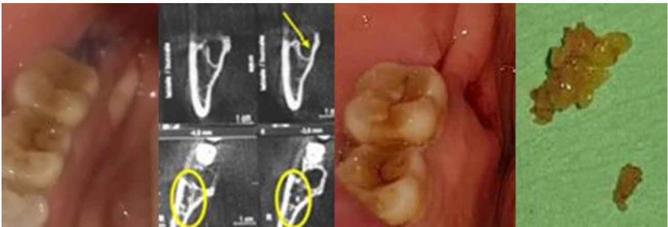
Fig-2: a: asymptomatic exposed bone in the lingual cortex after two months of the molar 48 extraction, b: oblique-coronal sections: a: osteosclerosis of the alveolar walls; distal abnormal bony trabeculae appearance with enlargement of the mandibular canal, c: conservative debridement of sequestrum bone