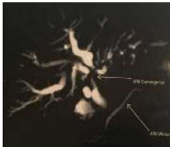
Fig-1: The Magnetic resonance cholangio-pancreatography showed a neoplastic process of the biliary confluence (Bismuth I)

We report the case of a 74-year-old patient with a satisfactory general health status (WHO 2) and an ASA score of one, who had a history of cholecystectomy for chronic cholecystitis a year earlier. The patient was admitted at our department for jaundice, rapid weight loss (10kg in 1 month) without fever. His lab results showed elevated total bilirubin levels at 53.05mg/L, gamma glutamyl transferase (GGT) levels at 123 U/l, with barely increased transaminases levels. Serology results for hepatitis were negative. At this stage, the diagnosis was suggestive of postoperative stricture due to bile duct injury from his previous surgery. An ultrasound (US) showed a mass in the mid portion of the common bile duct in close contact with the portal vein and multiple lymph nodes.