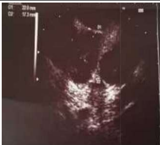
Fig-2: Tumoral stenosis of the distal part of the main bile duct on EUS

Endoscopic retrograde cholangiopancreatography (ERCP) showed a 3 cm long bile duct stricture from the proximal portion of the common bile duct just above the insertion zone of the cystic duct to