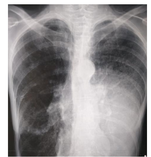
Fig-1: A front chest x-ray showing an alveolar