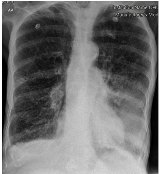
Fig-4: A front chest x-ray showing partial radiological resolution of alveolar consolidation of left lowers lobar