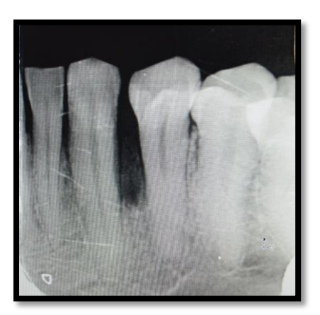
Figure 2: IOPA radiograph showing oval radiolucency in between canine and premolar

radiolucent area of oval shape between canine and premolar roots (Figure 2).