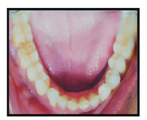
Figure 1b: Swelling in lingual aspect of affected region

Swelling was also found in lingual aspect too (Figure 1b).