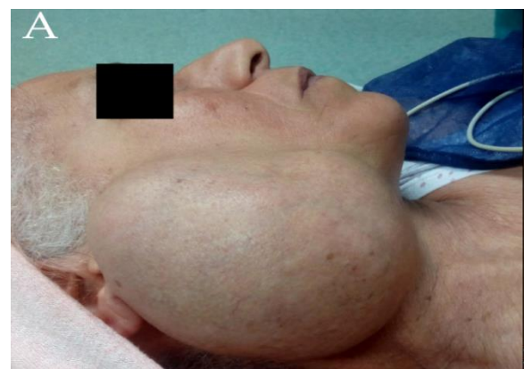
Figure 1: Clinical Photograph to show the right parotid mass measured 15 cm in a 68-year-old female patient

The outcomes are favorable; the patient woke up without postoperative complications especially no signs of facial palsy (Figure 4). Histological examination of the operating room confirmed the diagnosis of a pleomorphic adenoma of the parotid without signs of malignancy.