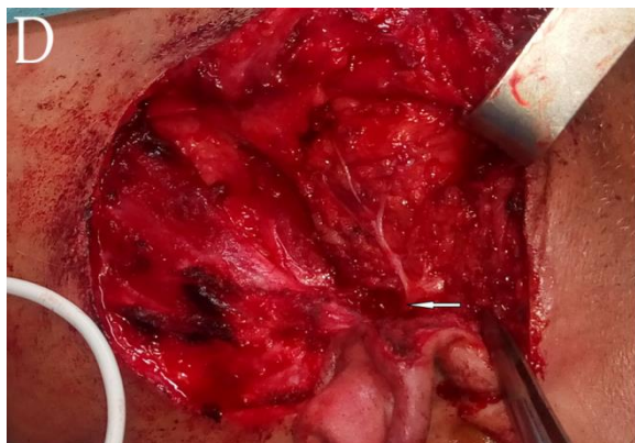
Figure 4: An intraoperative view showing the course of the right facial nerve that was respected during the operation (white arrow)