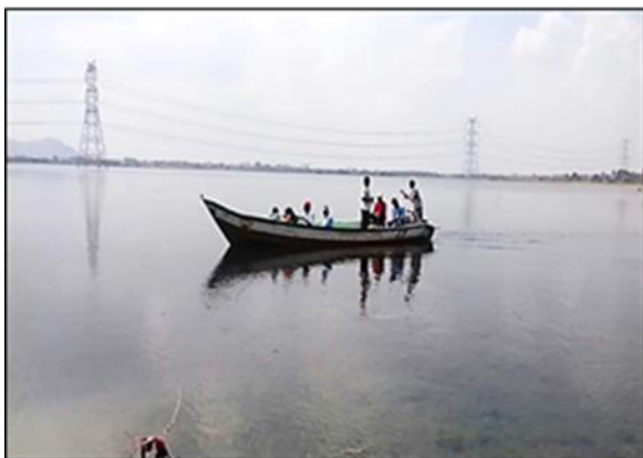
Figure 3: Bathymetry survey using Q-liner

The waterspread area of the tank delineated from Google Earth was used in the formation of grids at 20m x 20m interval using ArcGIS. Bathymetry survey was carried out in the Arungunam tank using Q-liner (Figure 3) and demarcation of the waterspread boundary was carried out using a hand-held GPS (Figure 4). The readings were taken at every 90 seconds interval along a line. Then the next line was taken up which was set out with an offset of 20m from the first line. Q-liner could be used to measure depths ranging between 0.35m to 10m. The points where the depth was less than 0.35m were measured by using a scale arrangement. Depths were measured at 148 points in the waterspread area during the survey (99 points taken using the Q-liner and 49 points using a scale arrangement). The data stored in the Personal Digital Assistant (PDA) were retrieved using the Q-liner review software. The depth values obtained from the PDA were converted to reduced levels (RL) with respect to the top of weir.