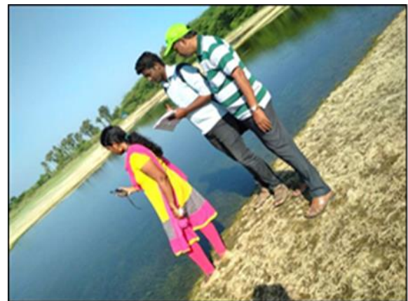
Figure 4: Demarcation of the waterspread boundary using a hand-held GPS

The points surveyed were mapped using ArcGIS and the corresponding depth values were interpolated using Kriging method for the entire waterspread. Contours were generated from the interpolated values at an interval of 0.05 m followed by Triangulated Irregular Networks (TIN) from which the capacity of the tank was estimated using the surface volume tool.