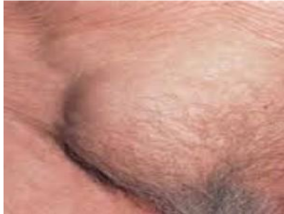
Fig-1: Preoperative image of right inguinal hernia

week later and the surgical area looked healthy with no signs of surgical site infection. Pathology revealed an acute appendicitis with mixed inflammatory cells in the appendiceal wall, presenting many eosinophils and small foci of granulomatous lesion.