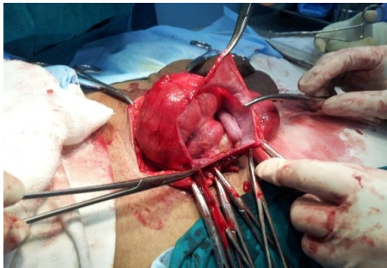
Fig-2: Intraoperative image showing appendix as hernial sac content