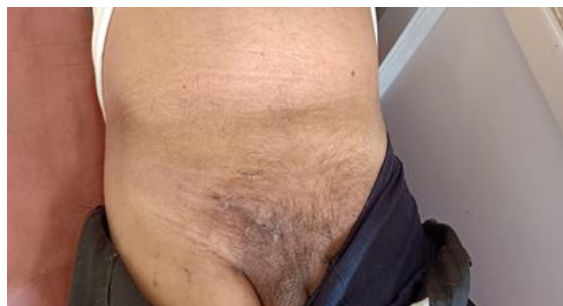
Fig-4: Post op image ( after 1 month) showing surgical site healed by primary intention