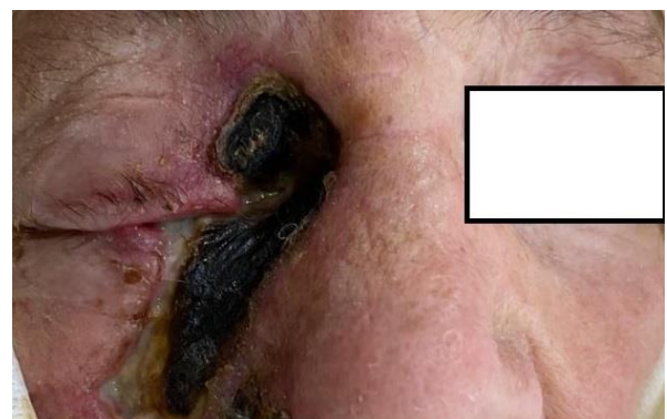
Figure 1: Large necrotic ulceration within the internal canthus and the wing of the right nose

Examination of the patient found a cachexic, asthenic patient. On inspection, we note the presence of a large necrotic ulceration encompassing the internal canthus and the wing of the right nose (Figure 1).