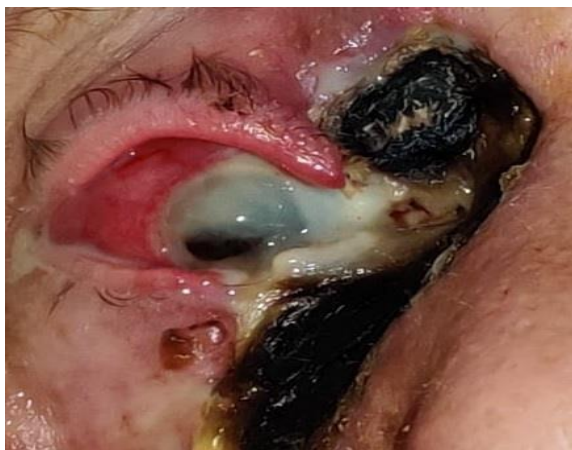
Figure 2: Purulent keratitis on the right side on a painful non-functional red eye