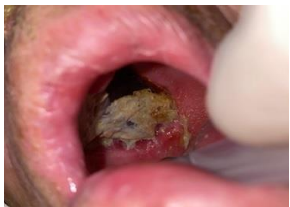
Figure 3: Necrosis of the right hemipalate

A craniofacial Computed Tomography (CT) showed invasive fungal sinusitis with right endocranio-orbital extension complicated by cavernous sinus thrombosis on the same side and fasciitis of the ipsilateral hemiface (Figure 4). A biopsy of the necrotic cutaneous ulceration was made in favor of ulcerated and suppurative dermatitis with the presence of non-septate filaments of irregular calibers, suggesting mucormycosis.