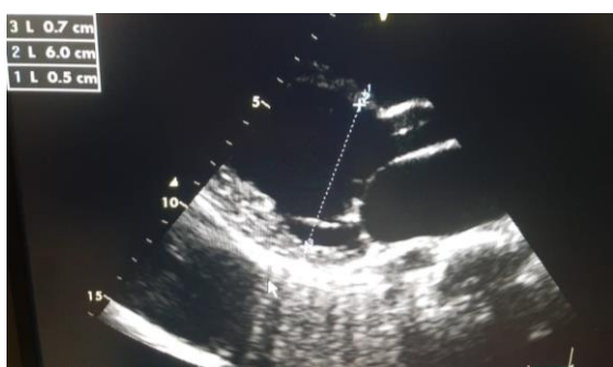
Figure 2: Transthoracic echocardiogram showed dilated left and right ventricles

A 12-lead electrocardiogram revealed sinus tachycardia. Transthoracic echocardiogram according to Z-score showed dilated left and right ventricles with global hypokinesia and severe biventricular systolic dysfunction (LVEF=26%) with moderate to medium mitral and tricuspid regurgitation (Figure 2).