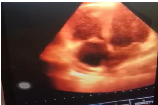
Fig-3: Apical four-chamber view showing free right atrium from the thrombus, 24hrs after starting treatment and also showing dilated right atrium and right ventricle