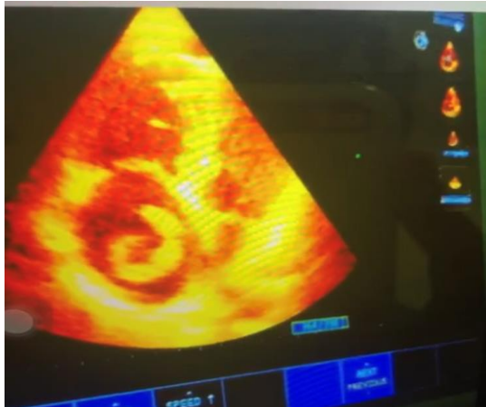
Fig-2: Apical four-chamber view showing a worm-like thrombus in the right atrium