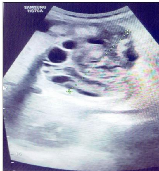
Fig-2: Ultrasound abdomen