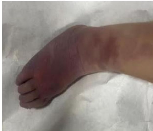
Fig-1: Picture of the right foot showing cyanosis