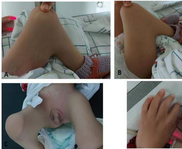
Figure 1: A. Left knee flexion contracture due to popliteal web. B. Right knee flexion contracture due to popliteal web. C. Bilateral cryptorchidism. D. Incomplete syndactyly of the right hand