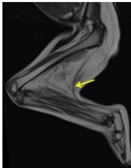
Figure 3: MRI of right popliteal pterygium showing an abnormally positioned popliteal nerve coursing away from the knee joint