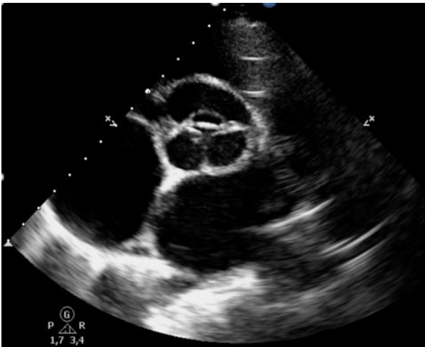
Figure 1: TTE Short Axis Parasternal Section: Visualization of pseudoaneurysm