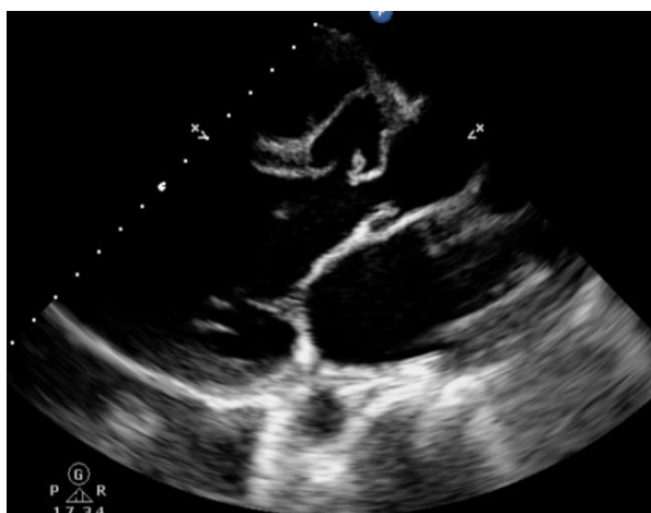
Figure 2: TTE Parasternal long axis view: showing a huge pseudo aneurysm of the coronary sinus and an image of vegetation on the right antero cusp