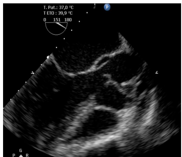
Figure 3: TOE: visualization of the pseudo aneurysm