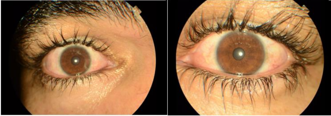
Fig-2: Appearance of the eyes after the treatment