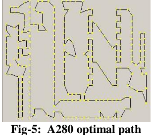
Table-1: TSP algorithm running results