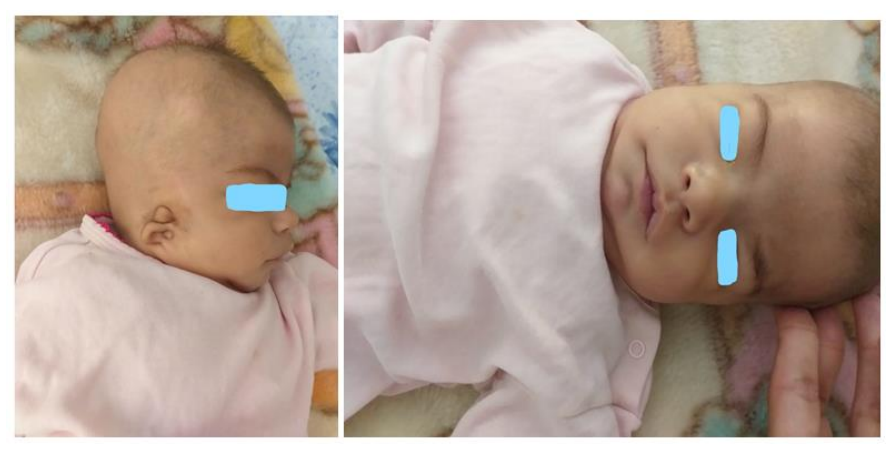
Fig 2: Craniofacial anomalies