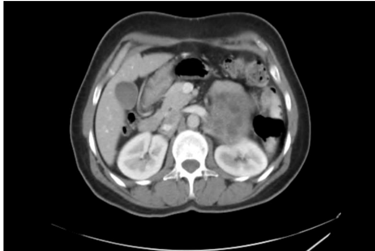
Figure 2: CT couple showing intimate contact with the left renal artery

The curative treatment for adrenal cortex is complete R0 excision by laparotomy [7]. Our surgical approach was a left subcostal laparotomy, a lowering of the left colic angle with a left coloparietal detachment were necessary for adrenal exposure (Figure 3).