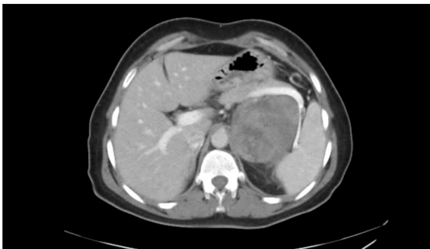
Figure 1: CT section showing an adrenal tumor in intimate contact with the splenic artery

The examination of first intention in our context is the CT scan, having objectified an adrenal tumor measuring 9cm which presents an intimate contact with the splenic artery and the left renal artery (Figure 1), it served us to eliminate the metastases and invasion of neighboring organs (Figure 2). An adrenal scan was done, showing left adrenal uptake. The pet scan was not performed.