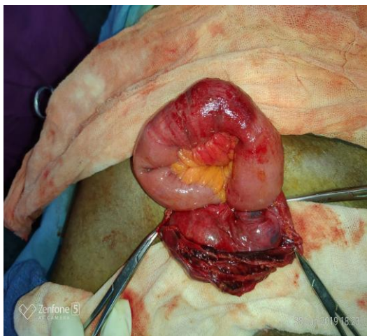
Fig-3: Showing congested small bowel loop

Post-operative period was uneventful. Patient was discharged on seventh postop day after regaining normal bowel and bladder habits and advised followup after 5 days for suture removal.