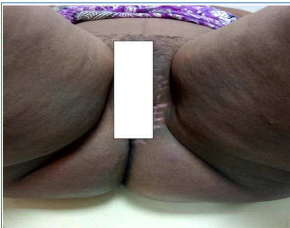
Fig-3: 15 days after the excision

The operative course was quite simple. The heaviness and discomfort was disappeared.