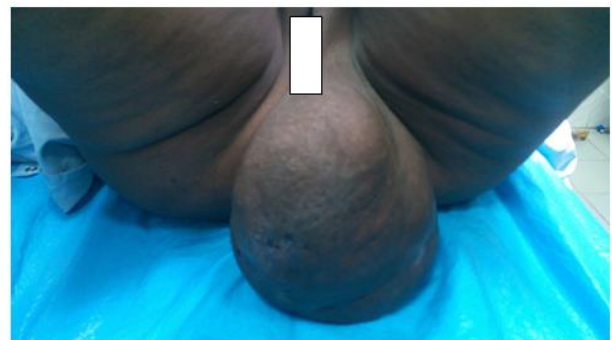
Fig-1: Appearance of the tumor before surgery

were no inguinal nor vulvar lymph nodes. The rest of the clinical examination was normal.