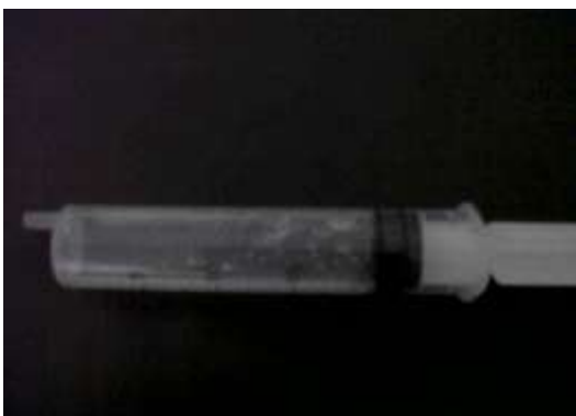
Figure 4. 20ml Syringe just after vigouros shaking with micro-bubbles