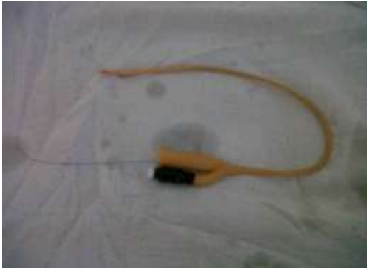
Figure 1. Size 8 Foley catheter with stylet