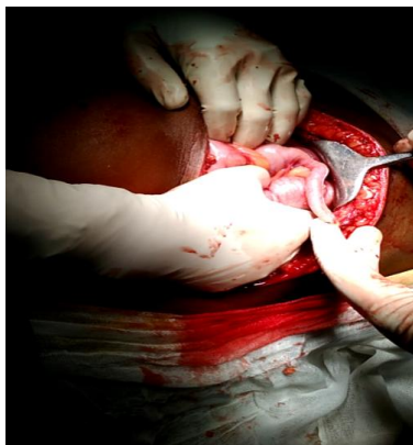
Fig-3: Intra operative picture showing caecum with appendix on left side of the chest

Due to small bowel obstruction and respiratory distress patient was taken for emergency procedure through left subcostal incision peritoneal cavity entered - jejunum was dilated, ileum, cecum with appendix, transverse colon was found herniating into the thorax, content was reduced and defect of size 6.5*4 cm noted in posterolateral surface of diaphragm which was closed by using non absorbable suture material prolene in two layers.