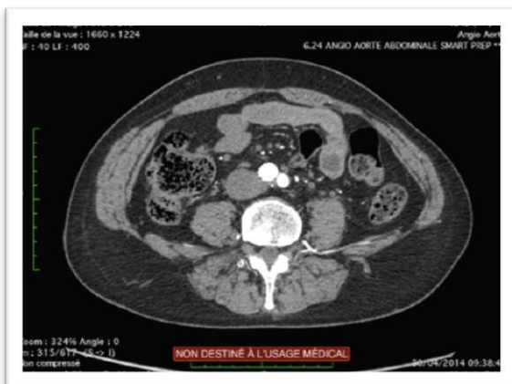
Fig-4: Two-year follow-up CT angiography: permeable stent with no endoleak