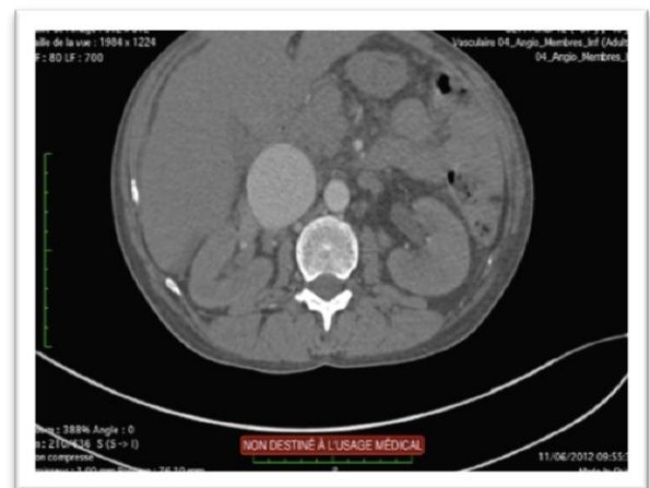
Fig-1: CT angiography of the abdominal aorta at arterial time showing the opacification of the inferior vena cava

A follow-up angioscanner exam two years later shows definitive exclusion of the fistula with a reduction in the size of the inferior vena cava and supra-hepatic veins, and no endoleak (Figure-4).