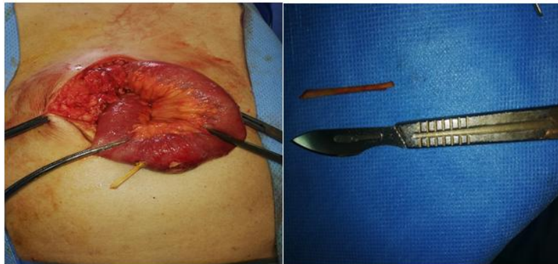
Fig-3 and 4: Showed off the presence of a white line hernia with a 4 cm collar and chicken bone splint

presence of a white line hernia with a 4 cm collar, containing a viable small bowel loop, strangulated and perforated by a chicken bone splint of 4cm. (figures 3 and 4).