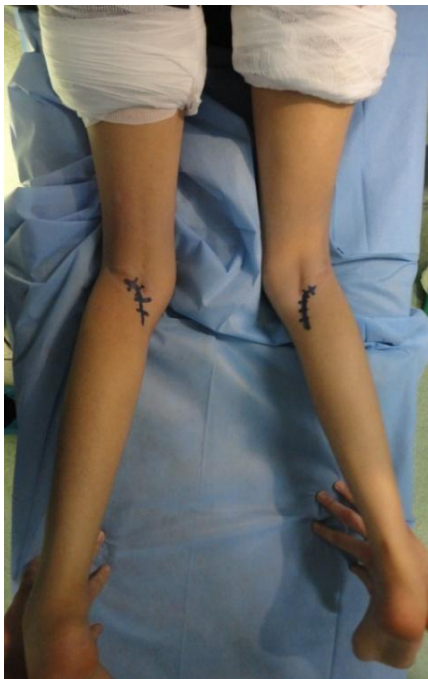
Fig-2: Posterior approach to the knee

As for the open posterior arthrolysis which is a very elective way for the repair of the posterior cruciate ligament not risking damaging the vascularization of the latter, is based on a postero-medial retro ligament vertical arthrotomy (Figure-2).