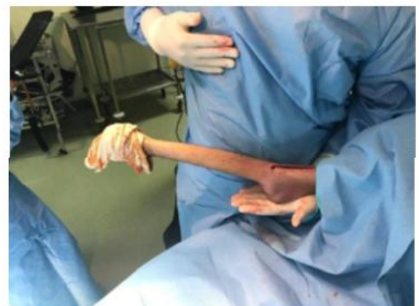
Fig-3: Shows intraoperative gain for posterior knee release in a patient with stiff knee flexion

The incisions are closed, with an intra-articular drain kept for at least 2 days (depending on the bleeding) and rehabilitation is undertaken immediately. This technique has few drawbacks apart from the