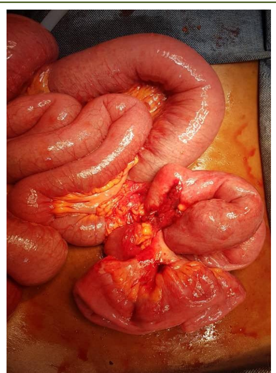
Fig-3: After section of the flange, highlighting a junctional level