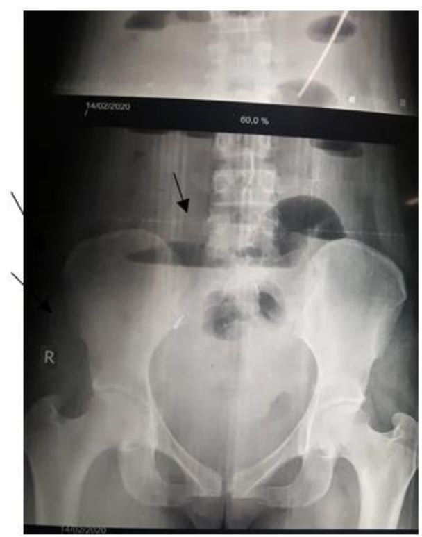
Fig-1: Hydroaeric images of the small intestine and radiopaque foreign object in RIF

follow-ups were simple; the patient was discharged afterrr the 6th post-operative day.