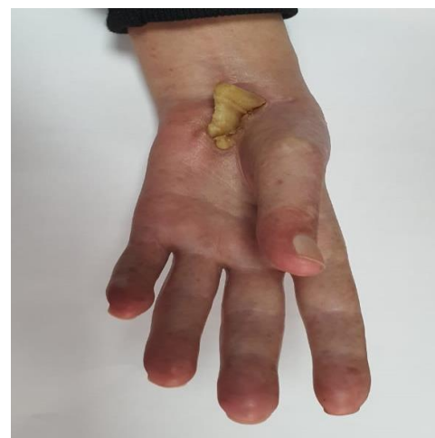
Figure 1: Hyperkeratotic lesion measuring 5 cm long with a wide non-ulcerated base

Two years later, similar lesions grew along the wrist. The clinical examination revealed a hard infiltrating hyperkeratotic lesion of the palm side of the left wrist with muscular atrophy of the hand and blockage of the wrist joint (figure 1). A full-body skin examination was otherwise unremarkable. There was no lymphadenopathy.