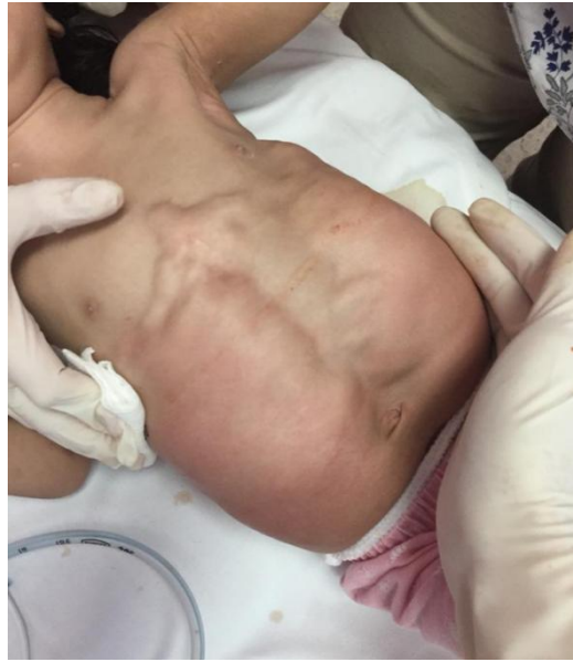
Fig-1: Large massive subcutaneous emphysema